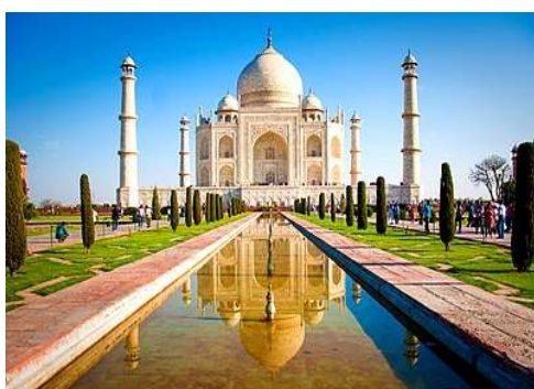
Picture Caption. Taj Mahal Exterior.

DishFUNCTIONAL 225 Lancaster Avenue, Malvern, PA 19355